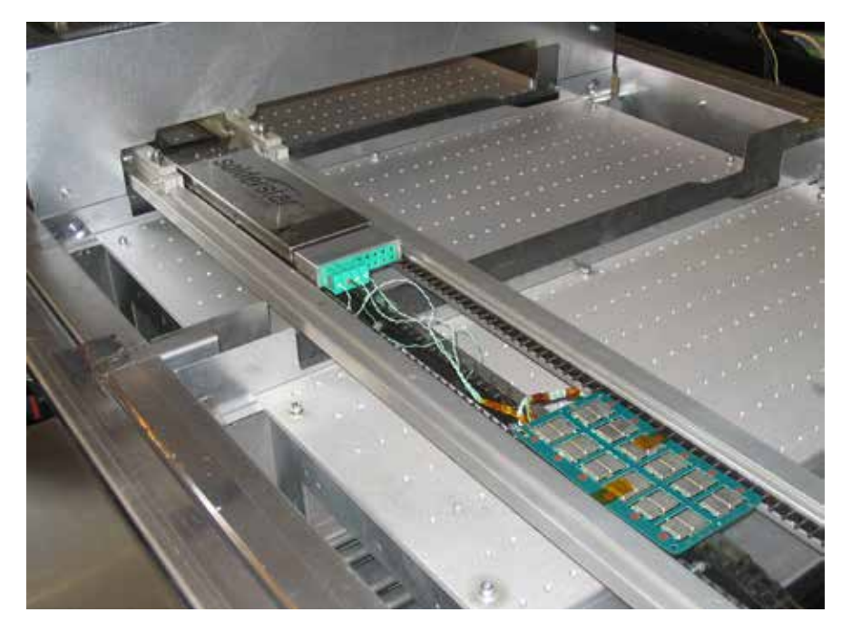
Figure 1. A profiler with four thermocouples attached to crucial components.

The main problem with this method is keeping the test board in good working order. The thermocouple sensors used to establish the profile during the initial set-up stage needs to respond quickly to temperature change and not influence the measurement. The result of this is that they are inherently fragile and need to be frequently replaced which is both time consuming and can result in measure-