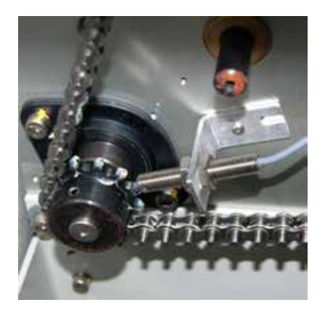
Figure 5. Close up of the speed sensor monitoring the conveyor speed.

All these benefits have improved manufacture and saved in time and money as it is a permanent and immediate method of profiling. Because of these obvious advantages manufacturers of military, automotive and medical devices are moving towards this technology as their preferred method of profiling as it is consistent, accurate and provides 100%